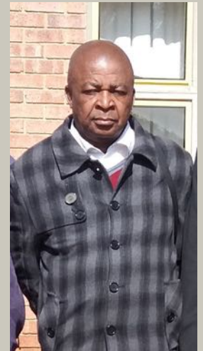
Above: New board member